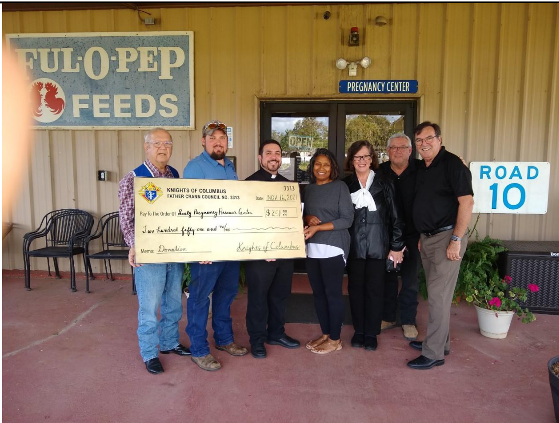
Knights Present $251 check to the Sealy pregnancy Resource Center